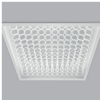
LGO-MP (Micro-Prismatic diffuser) Micro-prismatic diffuser creates variable effects according to your point of view

This is a fixture model with a wide usage and application. The light coming from multiple LED sources in LGO fixtures passes through the opal diffuser and provides an extremely soft and homogeneous distribution to the environment. Production for all types of suspended ceilings is possible. Therefore, production is made according to the brand/model of the suspended ceiling to be used. This fixture, like all Litpa fixtures is highly efficient and economical.