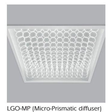
Micro-prismatic diffuser creates variable effects according to your point of view